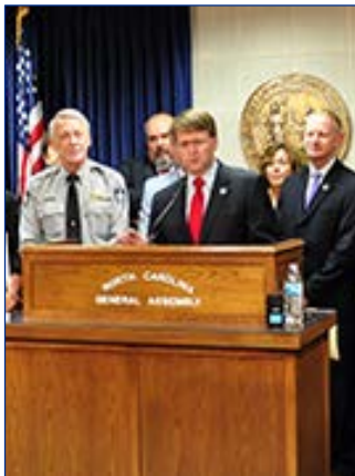
"RAISE THE AGE" PRESS CONFERENCE