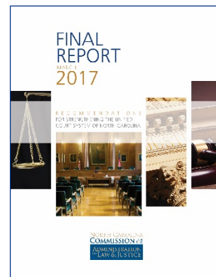
NCCALJ FINAL REPORT

They need specialty courts with judges who have expertise in resolving particular kinds of disputes, and I'm pleased to share that we've just opened our fourth Business Court at the Wake Forest University