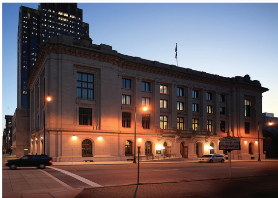
The Court of Appeals building is located at 1 West Morgan Street.

The Supreme Court is the state's highest court. This court has a Chief Justice and six associate justices, who sit as a body and decide cases appealed from lower courts, including the Court of Appeals. The Supreme Court has no jury, and it makes no determination of fact; rather it considers only questions of law, which means resolving a party's claim that there were errors in legal procedures or in judicial interpretation of the law in the trial court or the Court of Appeals.