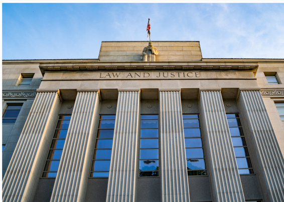
The Supreme Court building is located at 2 East Morgan Street.

Under the North Carolina Constitution, the Judicial Branch is established as an equal branch of state government with the Legislative and Executive branches. North Carolina's court system, called the General Court of Justice, is a state-operated and state-funded unified court system. The General Court of Justice consists of three divisions: appellate, superior court, and district court.