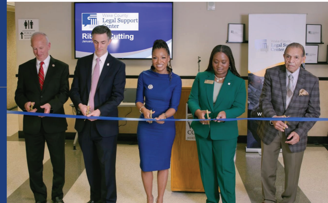
Wake County Legal Support Center ribbon cutting, January 9, 2023.